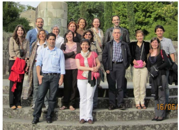
Participants of the NECOBELAC course in Braga, Universidade do Minho.

More information on the training course in Braga, presentations videos, interviews to course participants and photos are available on the project website. NECOBELAC partners and course participants worked together and enjoined the Portuguese atmosphere and local tradition.